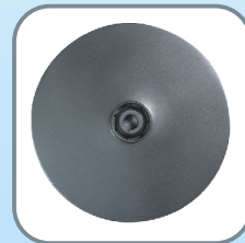
Stainless Steel Impeller