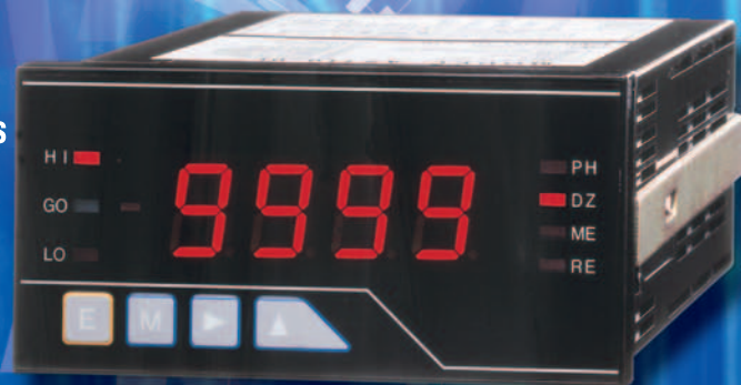
Display single type (A5X1X-XX)