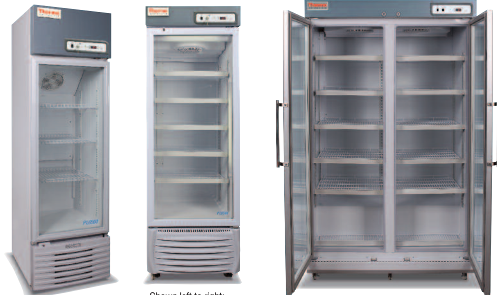
Shown left to right: Lab refrigerators PLR221, PLR386, PLR1006; Lab freezer PLF276