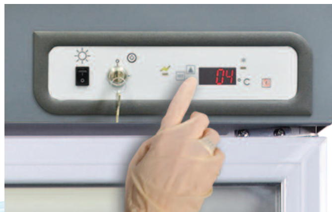
Thermo Scientific PL6500 Lab Refrigerators and Freezers

reliable cold storage for general-purpose applications