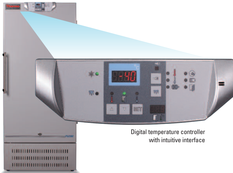
Digital temperature controller with intuitive interface