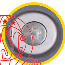
Door locks and additional space for padlocks on all models