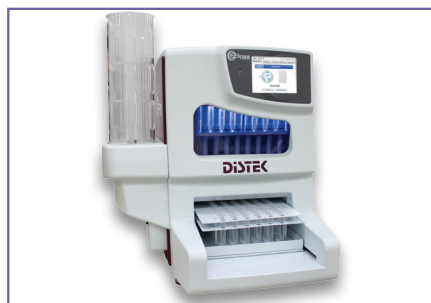
Eclipse 5300 with Filter Changer