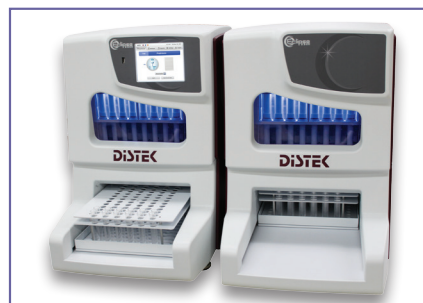
Dual Bath Parent / Child Configuration