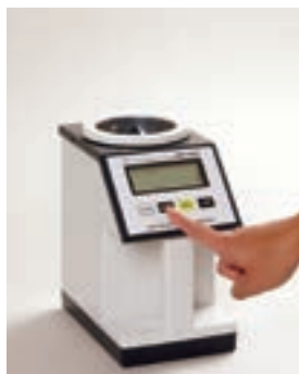
Select product number (application)