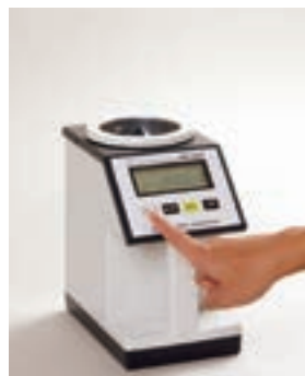
Press power ON