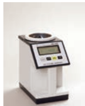
The moisture content is displayed