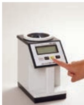
Press [MEA.] key