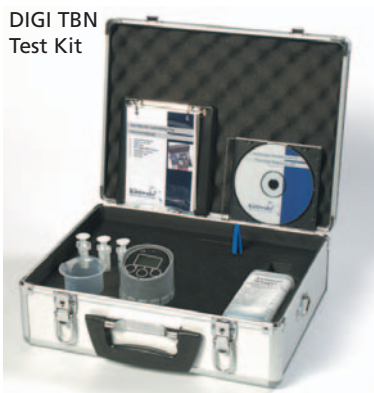
DIGI TBN Test Kit

Measure your oil's alkaline reserve and ability to neutralise acids from combustion.