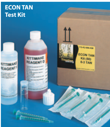
ECON TAN Test Kit

Testing for TAN is essential to maintain and protect your equipment, preventing damage in advance.