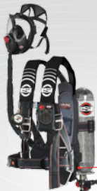
ISI EchoTracer Beacon