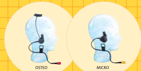
Helmet mounted communication headsets

"xxx" depending on the shape and the radio types. Please ask for our complete list of references.