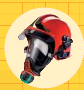
Connection kit for full face masks

Cradle with leather headband and quick size adjustment