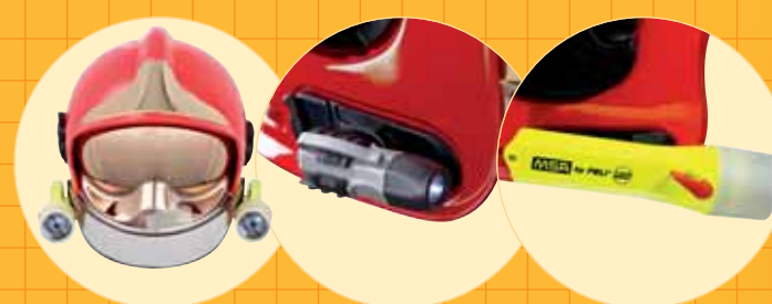
Atex lamps (zone 1 and zone 0) XS and XP range