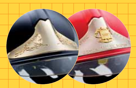
Customised front plate