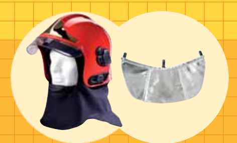
Neck curtain (integral or rear protection) Nomex, wool or aluminised