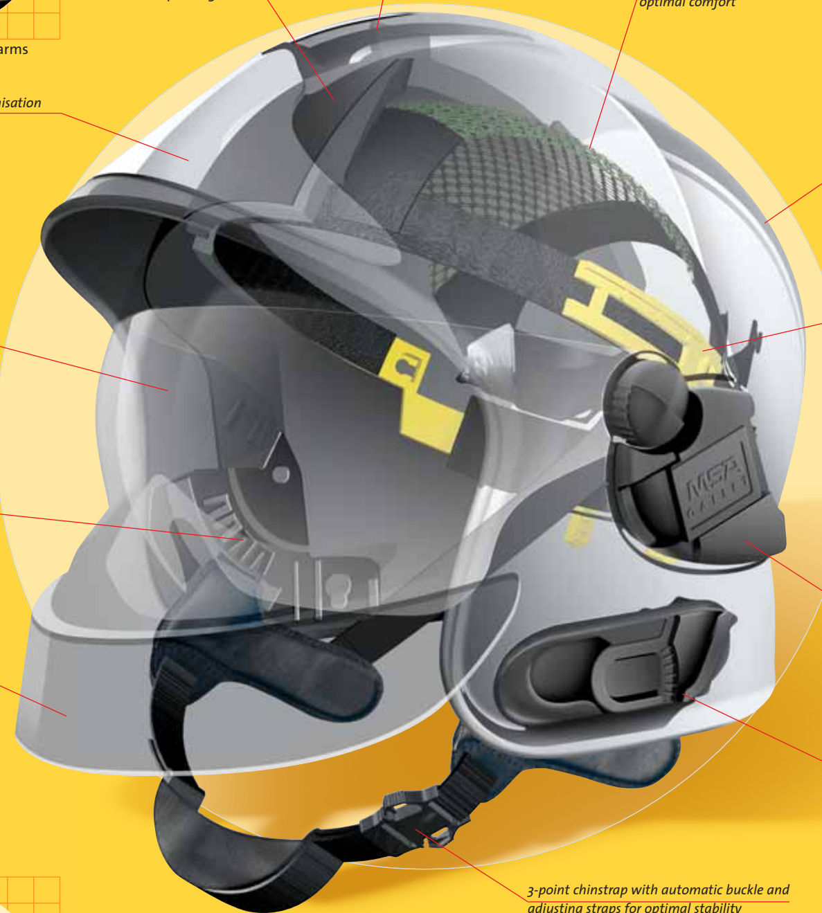
3-point chinstrap with automatic buckle and adjusting straps for optimal stability