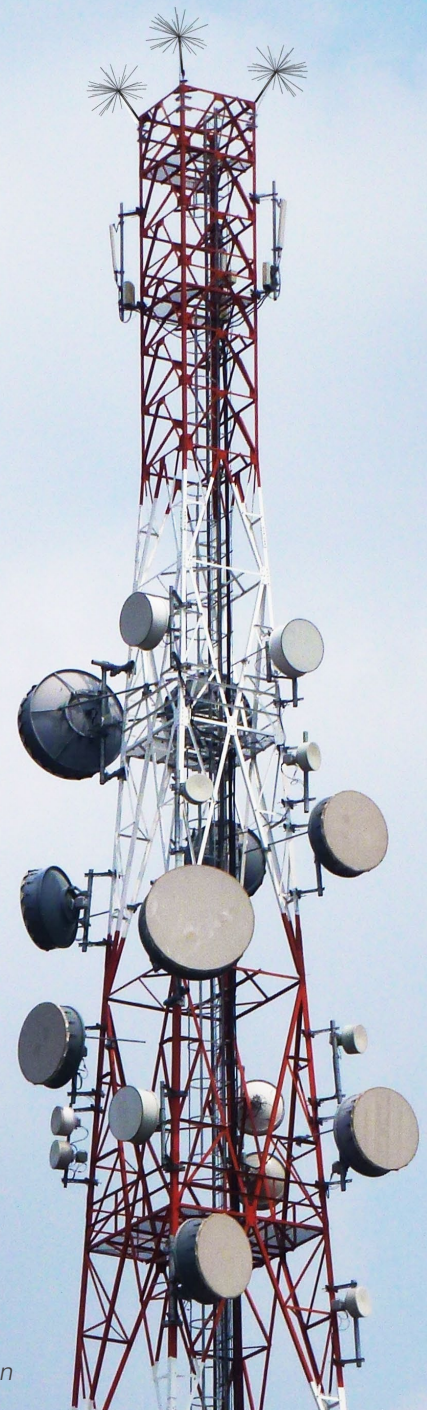
An illustration of a Tower Kit installation