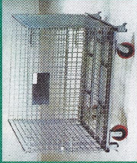
Fitting of castor wheels