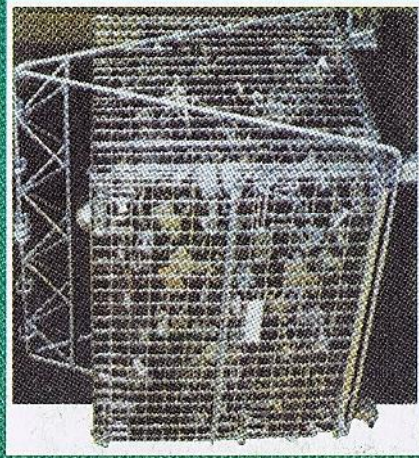
Overhead crane hook