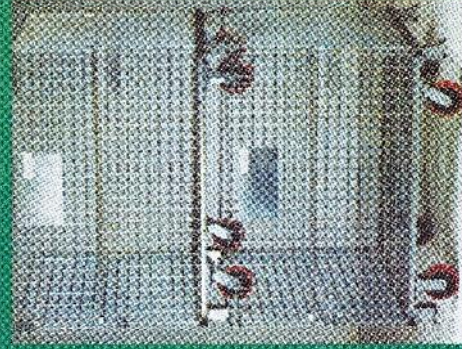
Stackable with castor wheels