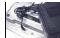
*AC Adapter (9V/1000mA)