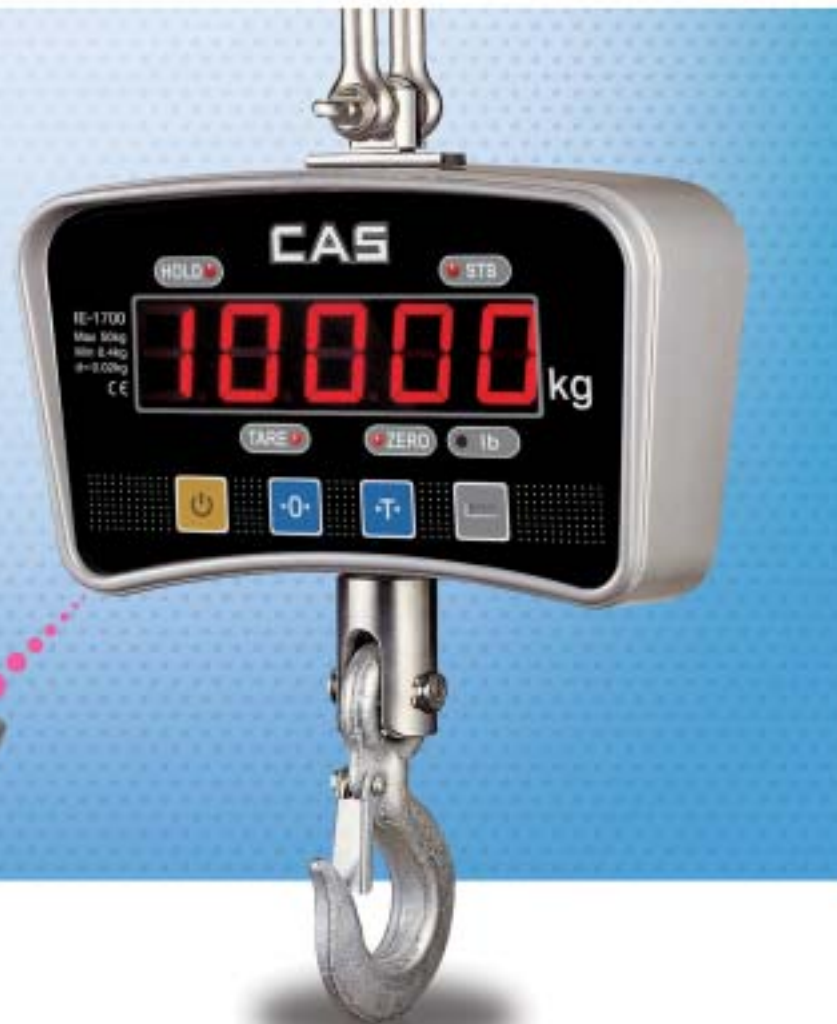
*Wireless remote controller