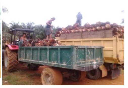
Operation in Java