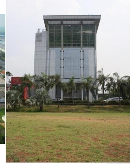
Head Office, Ancol