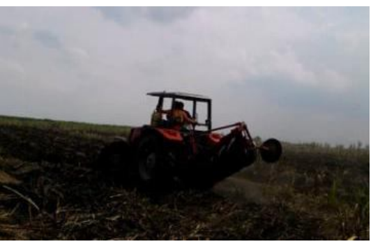
Operation in Sumatera