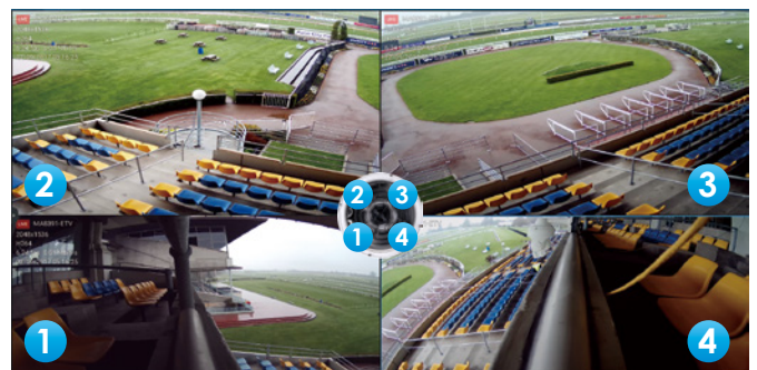
Multiple sensors, Adjustable views