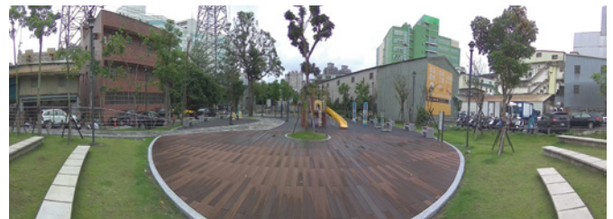
8MP Panoramic View