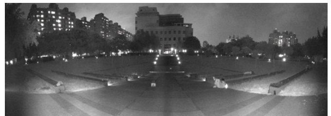
Panoramic IR Illumination