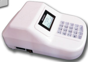
BSPOS Desktop Terminal