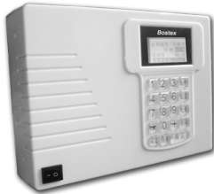
BSPOS Wall Mount Terminal