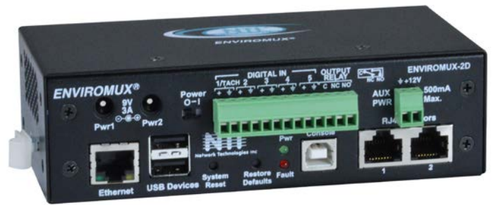
ENVIROMUX-2D (Front & Back)