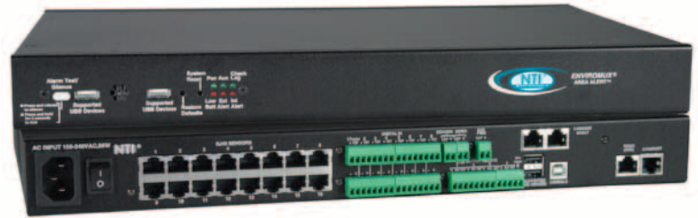
ENVIROMUX-16D (Front & Back)