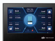
E4 LCD Monitor