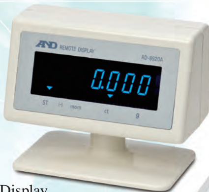
Remote Display (Optional)