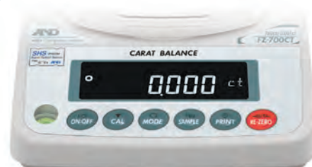
Reverse-backlit LCD display and plain key alignment

The contrast of the black and white display is extremely easy to read and prevents fatigue of your eyes. Combined with plain key alignment, the user-friendly display eliminates confusion and errors, and makes your long hours of work less tiresome.