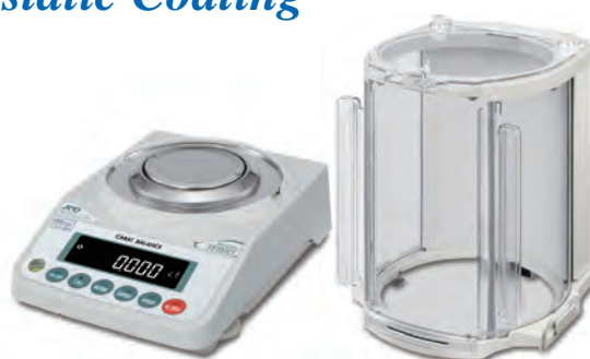
Removable Breeze Break

It is also treated with an antistatic agent to ensure stable weighing.