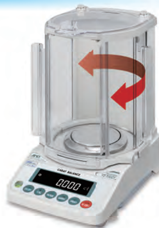
Rotary Sliding Doors

The balance requires no extra space at the rear in order to access the weighing chamber, as the doors simply rotate behind the balance.