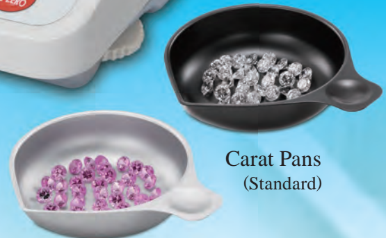
Carat Pans (Standard)