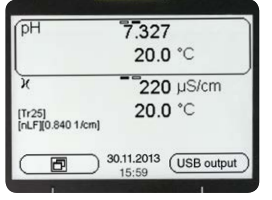
Display with two measured values