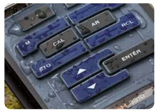
Robust sealed silicone keypad - 100% waterproof