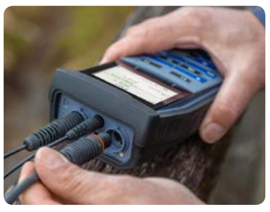
With waterproof mini USB-B interface for up-todate data transfer.