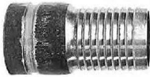
Grooved - unplated steel 25mm to 300mm