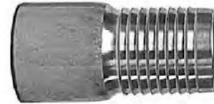
Bevelled - unplated or 316 stainless steel 15mm to 300mm