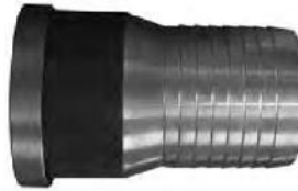
Shouldered - plated steel 25mm to 300mm