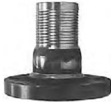
Flanged - Table E Hosetail 40mm to 300mm