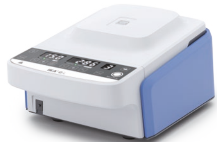
G-L Centrifuge Ident. No. 0030000774