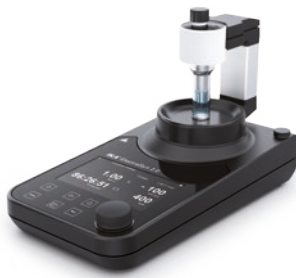
ElectraSyn 2.0 Package Electrochemistry Kit Ident. No. 0020008980

If required, the following IKA devices are available for your lab to enhance your work using PETTE fix and vario pipettes: