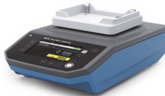
Matrix Orbital Thermoshaker Ident. No. 0030000627