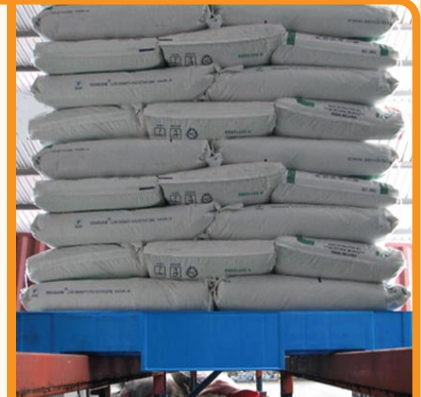
Safe beam racking in selective rack