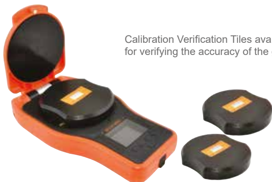
Calibration Verification Tiles available for verifying the accuracy of the gauge