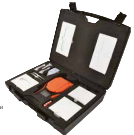
Supplied in a robust carry case