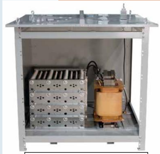
NGT 2400Kv- 240V GTR with stainless steel resistor banks and Type 3R powder

Post Glover's GT product line is designed for applications on systems up to 15kV. Secondary voltage is typically 240 volts, and resistors are designed according to customer specification. Typical construction is a dry type transformer with a secondary resistor mounted in a common enclosure.