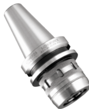
MAS 403 BT FC