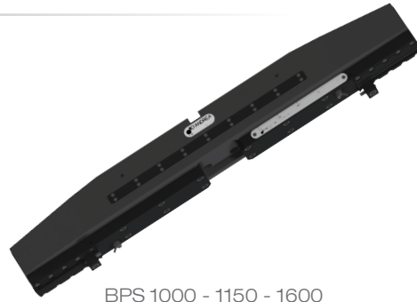
BPS 1000 - 1150 - 1600