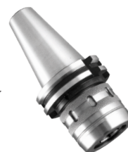
DIN 69871 FC