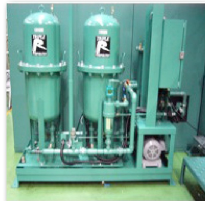
CS-SS306-2RQ at Volvo Korea