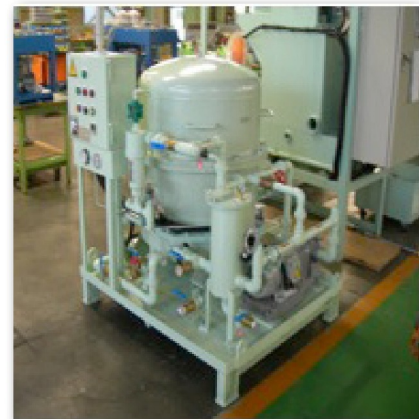
CS-SS315-1RQ at Suzuki Manufacturing