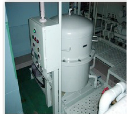
CS-SS315-1RQ at Komatsu Engineering