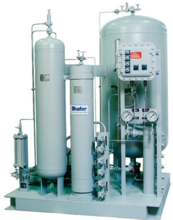
HPU with offshore trim and coating