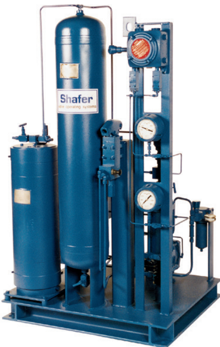
HPU with pneumatic driven hydraulic pump

The pneumatic powered HPU is designed for use with sour gas, sweet gas, or instrument air at pressures ranging from 60 psi to 2000 psi. The system converts pneumatic pressure into stored hydraulic power by means of a pneumatic driven hydraulic pump. The system is totally self-contained and requires no electrical power, pressure switches or motor starters.