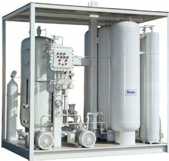
Electric motor powered HPU

Standby power for fail-safe valve operation