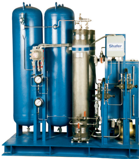
NEMA 4, HPU for a water industry application