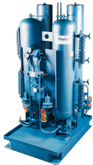
Natural gas powered HPU

Pneumatic powered HPUs are used frequently on offshore platforms. The advantage is that actuator sizes can be reduced significantly because the low pressure pneumatic power source has been converted to high pressure hydraulic power.