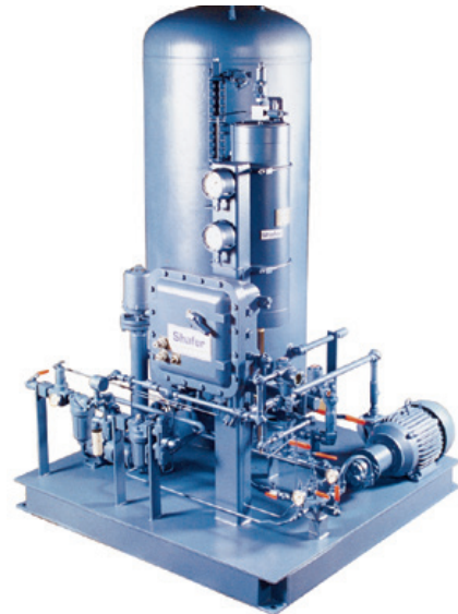
Pumping unit for use with satellite accumulators