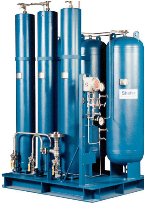
Satellite accumulator bank for a fail-safe application

The entire system is field proven and guaranteed