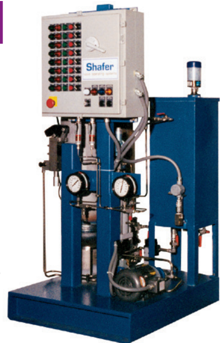
NEMA 4, HPU

HPUs are designed to provide sufficient pressure and volume to stroke valves singly or in unison, depending on customer needs. Satellite accumulators are available for fail-safe applications.