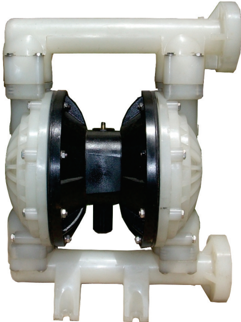
DPB 50 PPT