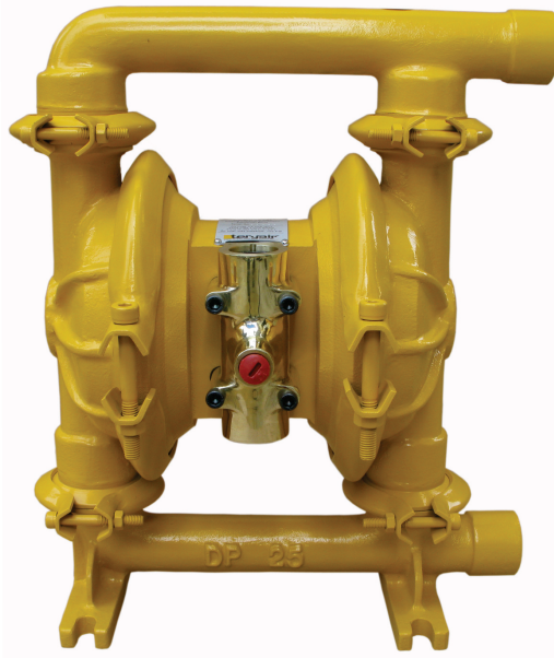
Model No.: DP25ALB