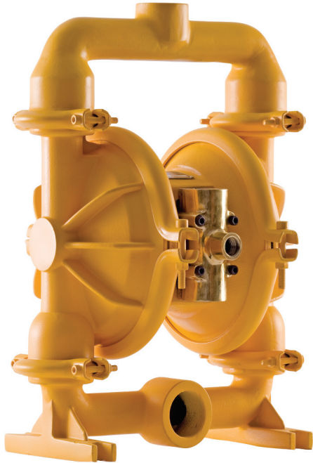
Model No.: DP40ALN