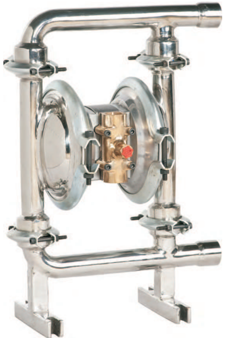
1 inch Stainless Steel Pump DP25SST

Teryair seals commitment to quality with tight quality control on input materials, processes, testing and packaging of products. The Teryair factories are close to India's largest seaport, Mumbai. This allows shipping and turnover in the shortest possible time.