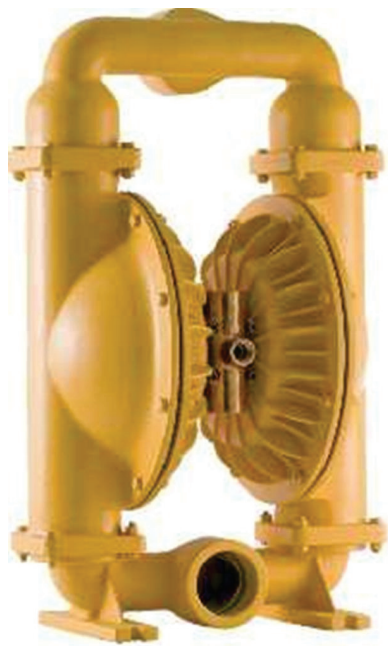
Model No.: DPB75ALB