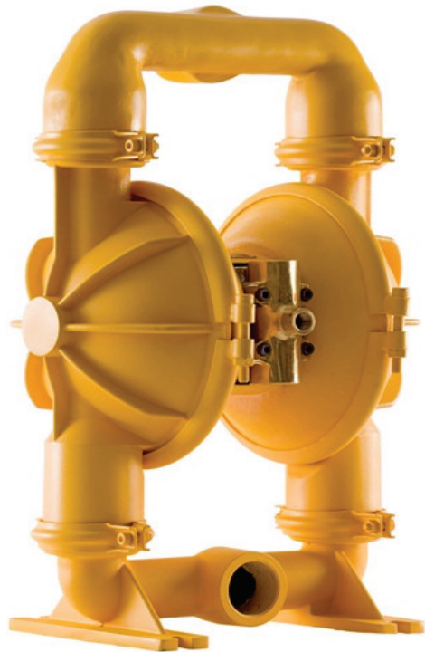
Model No.: DP50ALN