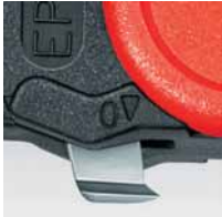
Adjustable cutting depth