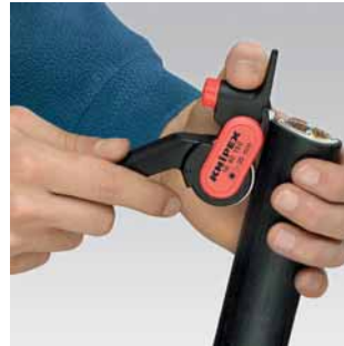
Setting the tool for longitudinal cut