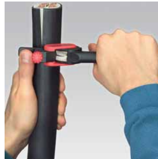
Turning the tool for circumferential cut