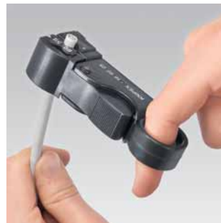
3 stripping steps in one operation