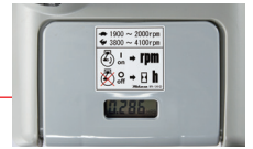
● Maintenance Hour Meter