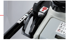
● Throttle Lever with fuel cut off mechanism inter locked kill switch