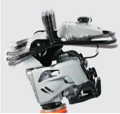
● VAS Handle