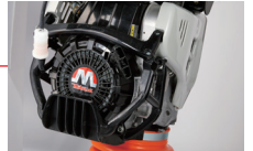
● Engine Guard