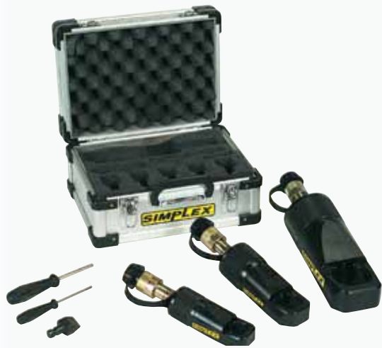
NS Series Shown

Nut Range .....► .5 - 2.88 in. Weight .....► 1.8 - 75.1 lbs. Maximum Pressure .....► 10,000 psi