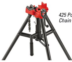
425 Portable TRISTAND Chain Vise