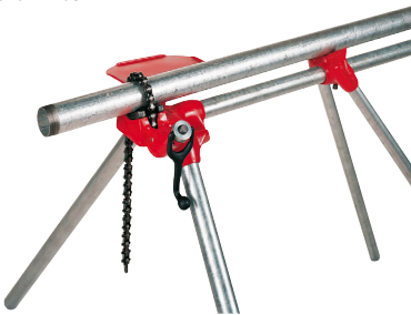
Top Screw Stand Chain Vise

** For model 460-6, jaw for plastic pipe, Catalog No. 41280 available; order separately.