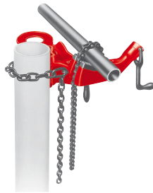
Top Screw Post Chain Vise