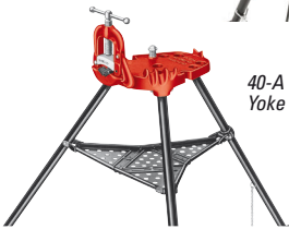
40-A Portable TRISTAND Yoke Vise