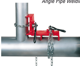
Angle Pipe Welding Vise