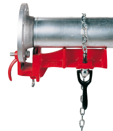
Flange Pipe Welding Vise