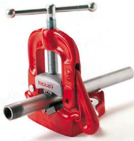
Bench Yoke Vise