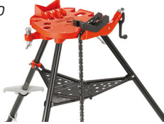
460-12 Portable TRISTAND Chain Vise