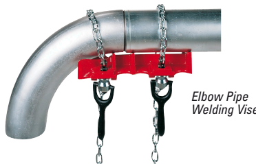
Elbow Pipe Welding Vise