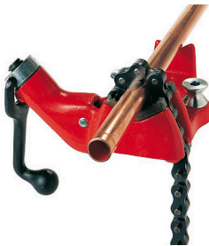
Top Screw Bench Chain Vise