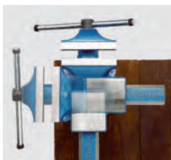
Infinitely adjustable swivel base allows vise to lock securely in any position