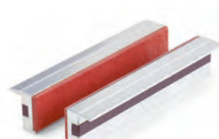
Fiber Magnetic Jaw Covers