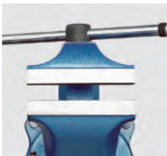
Generously sized jaws provide greater clamping surface