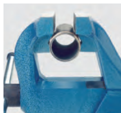
Large capacity pipe jaws for secure clamping

The RIDGID® Model F-Series vises are constructed of 75,000 psi tensile strength forged steel. These sleek, rugged vises out perform their bulky cast-iron competition.