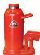
Bottle jacks, hydraulic Page 156