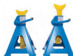
Axle stands Page 163