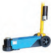
LIFTECH LT215L Page 160