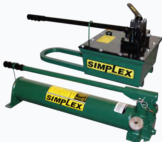
P140 & P461D Shown

Reservoir Capacity .....► 175 - 460 cu.in.