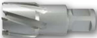
\varnothing in mm Cutting depth 35 mm Prod.-No.