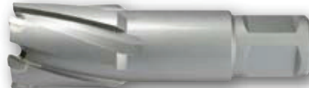
\varnothing in mm Cutting depth 50 mm Prod.-No.