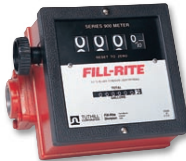
Model FR901 Series 900 4-Wheel Mechanical Flow Meter

No matter what your fuel transfer needs are, Fill-Rite has the right products—Heavy Duty, Standard Duty, or Economy Duty pumps and meters.