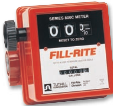
Model FR807C Series 800 3-Wheel Mechanical Flow Meter