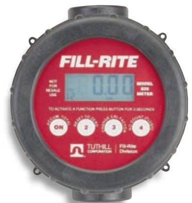
Model FR820 Series 820 Digital Flow Meter