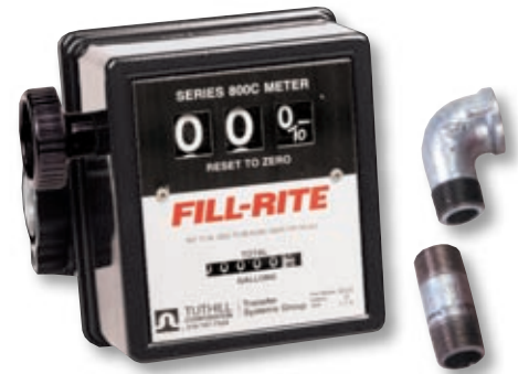
Model FR807CMK Series 800 Meter Kit for AC and DC Pump Products

Fill-Rite's line of mechanical and digital flow meters are designed to meet the stringent demands of customers who need to monitor fuel usage accurately and dependably. Rugged construction, easy to read numbers, and the flexibility of horizontal or vertical positioning are just three features of these superior meters. Plus, all can be field-calibrated for the utmost accuracy, regardless of the fluid.