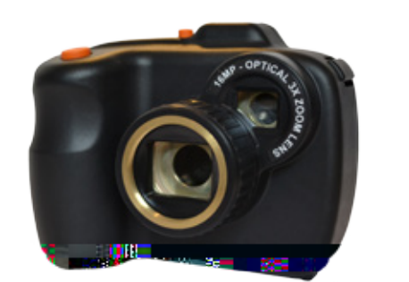
Sleek & rugged SLR design