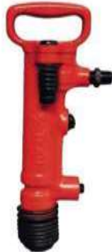
TCA - 7