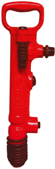
TCA - 7 ✓