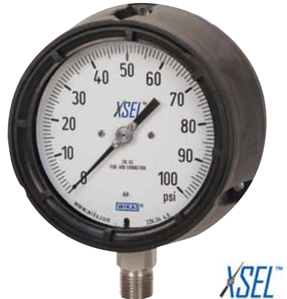
Bourdon Tube Pressure Gauge Model 232.34

Additional error when temperature changes from reference temperature of 68°F (20°C) ±0.4% for every 18°F (10°C) rising or falling. Percentage of span.