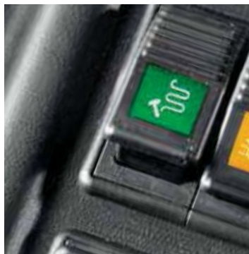
Button for activation of the filter shaking

Operated by a hydraulic motor which can reach up to 14,000 m 3 /h.