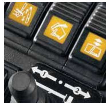
Hopper emptying buttons

The collection hopper is emptied by lifting it on vertical guides up to 180 cm.