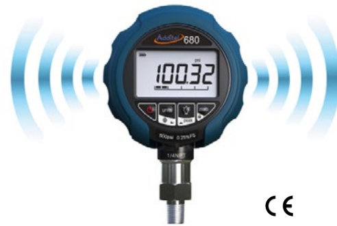
680 with data logging and wireless (optional)