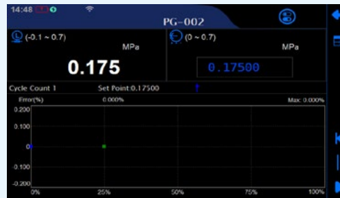
Pressure gauge / transmitter / switch calibration